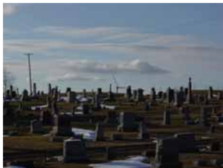
Oxford, Indiana West Side Cemetery. Note the wind generator in background, one of hundreds of these giant machines, generating electricity for the area grid. Never-stopping winds probably covered the area in the 1800's.